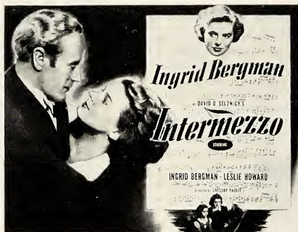
22 x 28